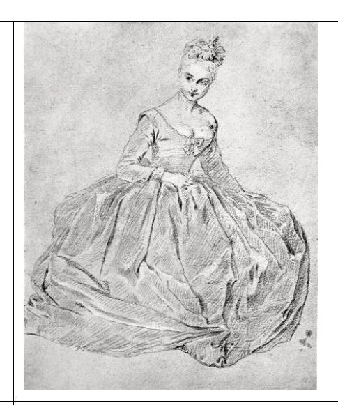
4. Philip Mercier, Seated Woman, sanguine and black chalk, 29.5 x 24.5 cm. Whereabouts unknown.

Through a serendipitous turn of events, it has been possible to locate a drawing for La Sieste in the Musée des Beaux-Arts of Grenoble (fig. 3). As is evident, it is a preliminary study, presumably drawn from a model, for one of the