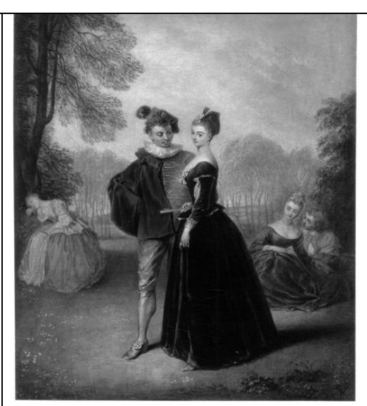
2. Philip Mercier, The Happy Encounter , 37 x 30.5 cm. Whereabouts unknown.